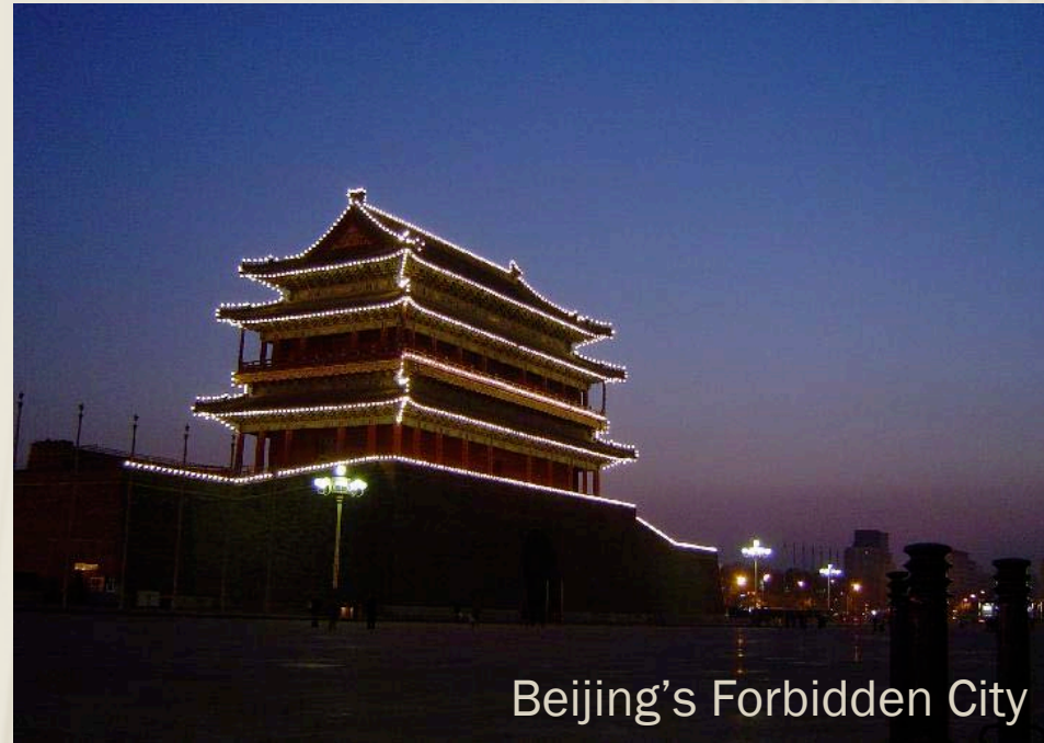
Beijing's Forbidden City

Alternatively, simply send us an email at info@worldclubnet.com . Your member will need to present a valid membership card upon visiting our private clubs in China.